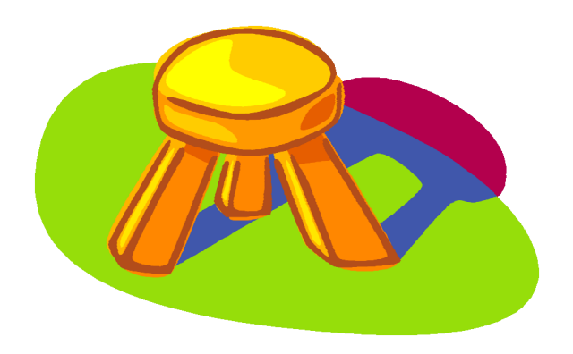
Disciples who are: growing in the grace and knowledge of our Lord Jesus Christ growing in Godly character growing in ministry skills

Are you ready to let the Lord work in your life, and through your life, to help "Make Disciples" of all nations?